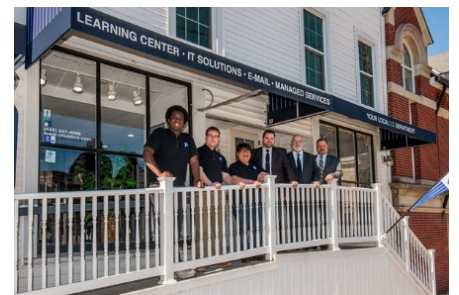
Corporate Staff Supports Click IT's Growing Franchise Store Network.

Click IT Chagrin Falls now provides to over 2,400 residents and commercial customers, technical services, products, and solutions in its retail-store setting. In 2020, through systematizing the business operations into a franchise model, we started offering entrepreneurial-minded people a huge opportunity to be in their own highly-profitable business, helping their community members thrive and prosper securely in this IT-driven economy. We now have 3 stores with more opening soon. See https://clickitstores.com .