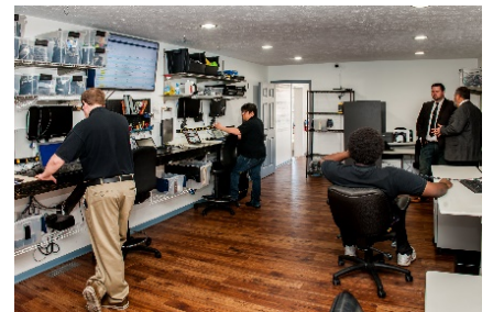
Franchisees are Provided All the Tools and Knowledge to Run Their Click IT Stores.