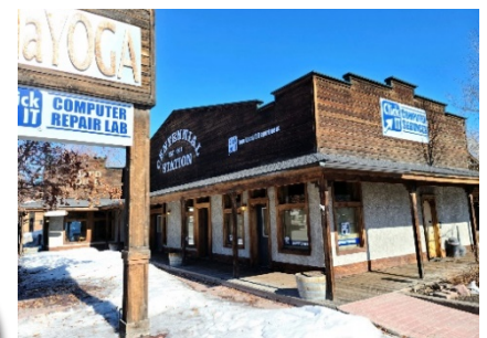
New Click IT Store in Sun Valley Idaho