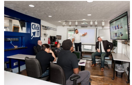
Teaching a class in Our Training Room.